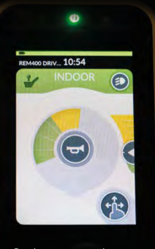
Swipe operation – Right hand use