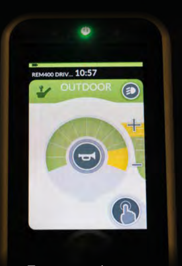
Tap operation – Right hand use