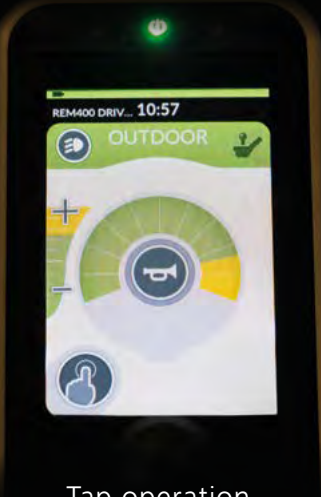
Tap operation – Left hand use